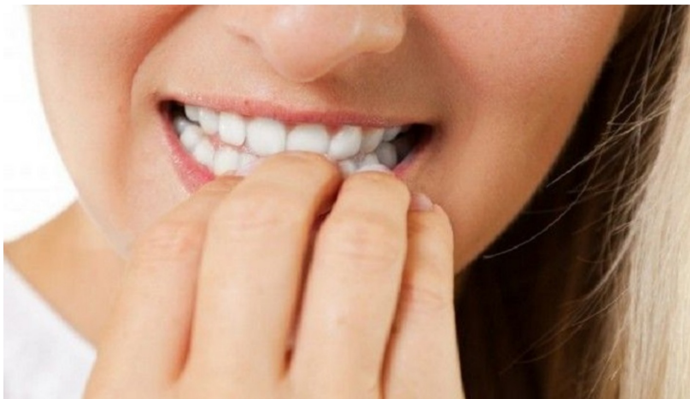
Look out for nail-biting

Lying with your mouth is one thing, but lying with your body is much harder. There are a few clear signs that suggest a person is lying. Look out for generally “shifty” behaviour, such as foot shuffling and nail biting. Another “tell” is when they subtly cover or shield vulnerable parts of their body, such as the eyes or throat. If a person looks like they are trying to protect themselves or is generally uncomfortable or nervous, it could indicate dishonesty.